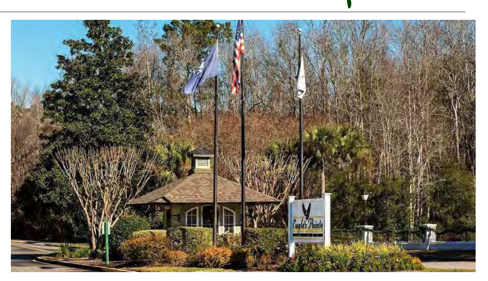
Message From the Board